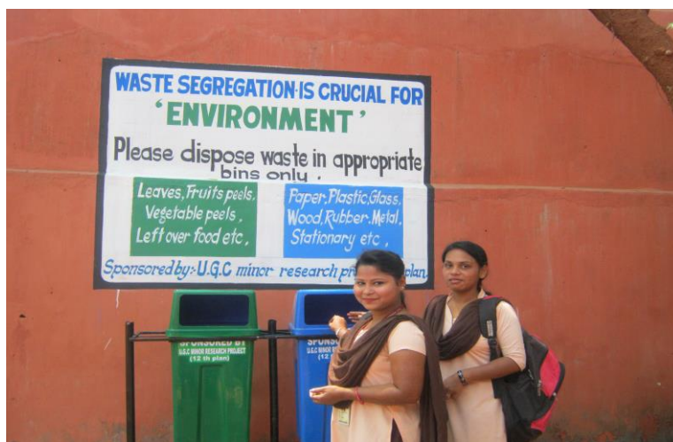
STUDENTS USING SEPARATE BINS