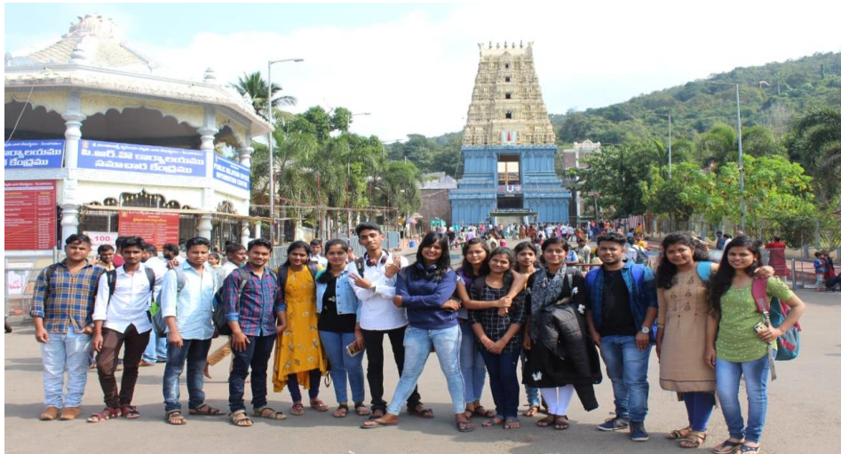
NARASIMHA SWAMI TEMPLE AT VIZAG

Honours students and staff had gone to Vizag on excursion on 5th of January 2020. Important places visited in this trip are, Sri Varahalaxmi Narasimha Swamy temple, Indira Gandhi Zoological park, VMRDA INS Kursura Submarine museum, Central city park, Ramakrishna and Rushikenda beach.